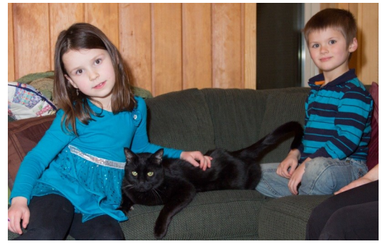
In January, we adopted Oliver!